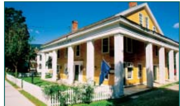
“Ye Olde Tavern”